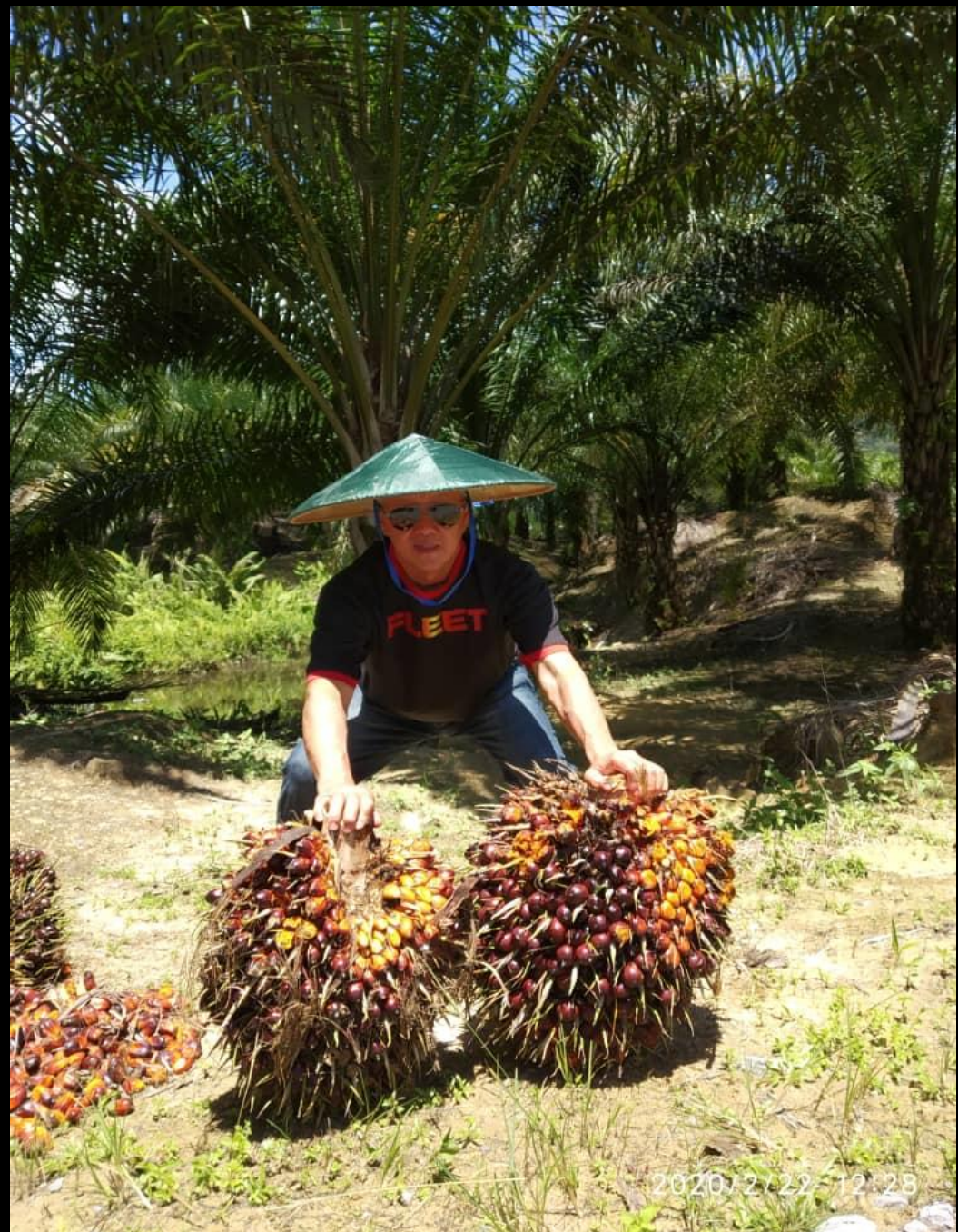
40+ kg bunches with Enhanced Photosynthesis.