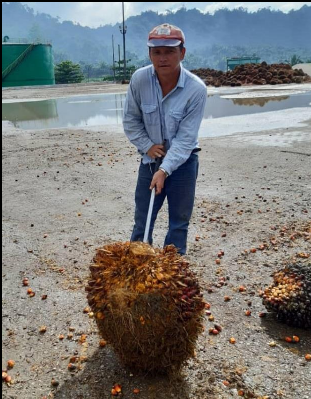
This fresh fruits' bunch reached 76 kilos.