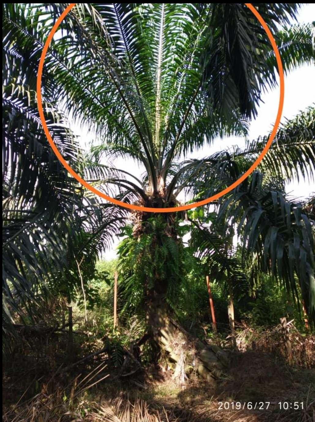
Stout and straight fronds within 3 months