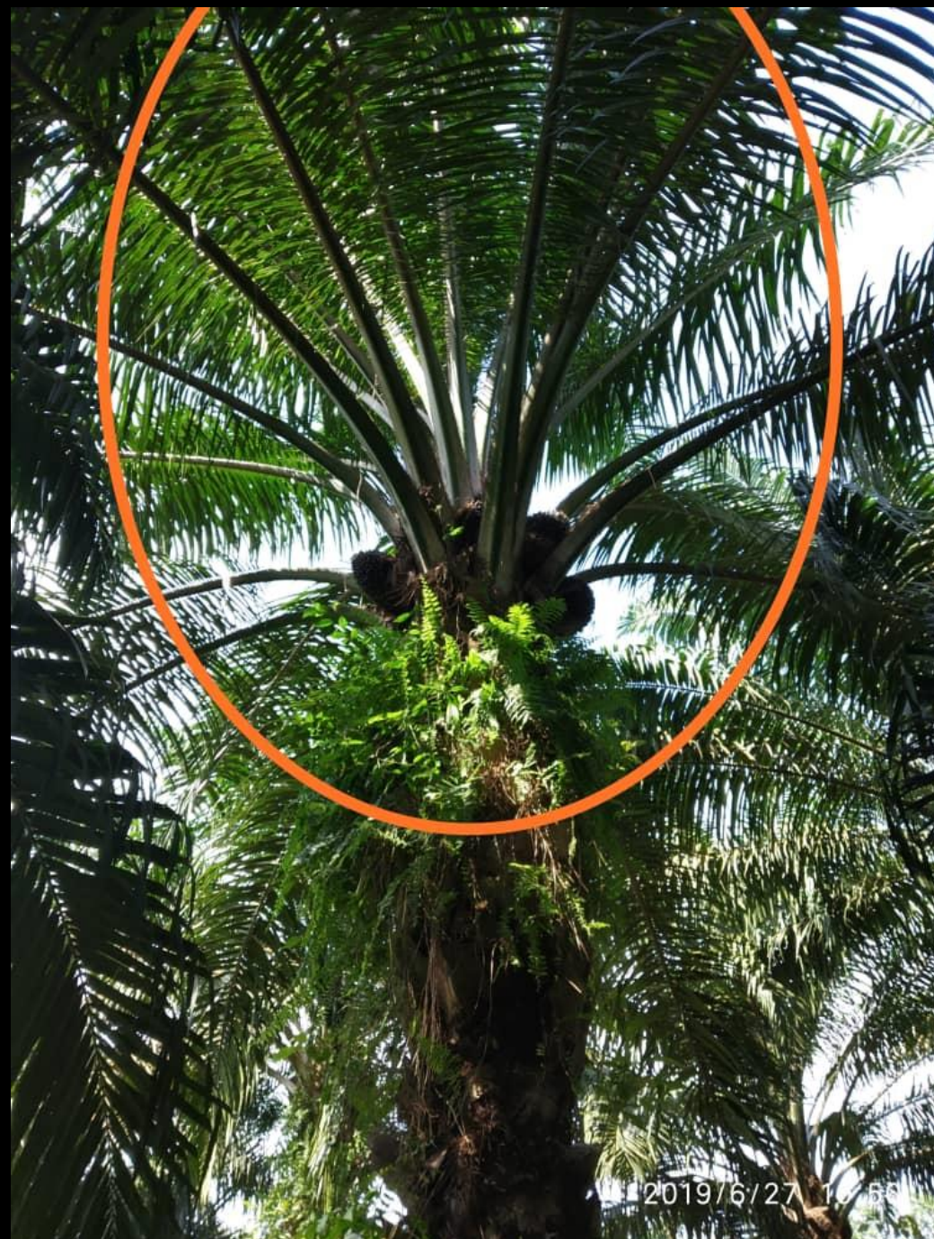
Better flowers setting and bigger fruits within 5 months